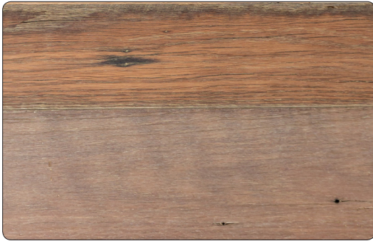
OCCASIONAL NAIL HOLES