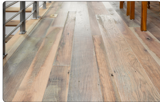
VARIED BOARD COLOR