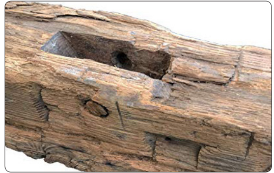
MORTISE POCKETS + PEGS